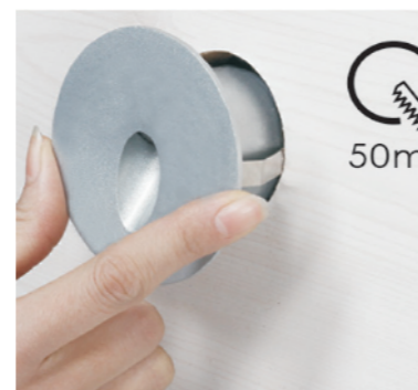
Installation with clips directly