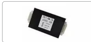
347v 480V Transformer