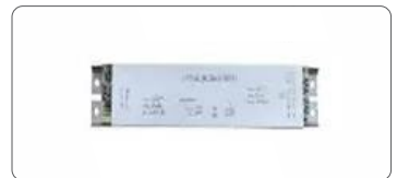
0-10V Dimming Driver