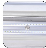
Screw Fix The Heat Sink