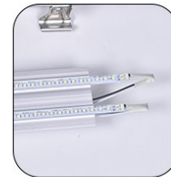
Replaceable Light bar