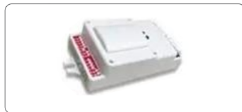
Micromove Motion Sensor