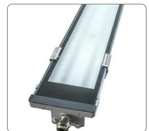
Frosted Tempered Glass Lens