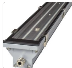
Transparent Tempered Glass Lens